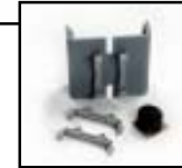
Optional DRC Kit for DIN Rail Mounting-Clips mount either direction on snap track