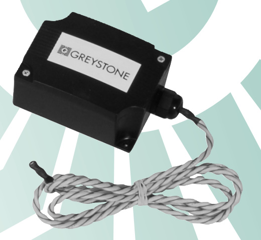
WD-100-XX - Water Detector c/w Conductivity Cable